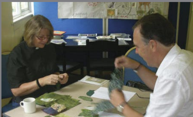
Byrness residents' first workshop