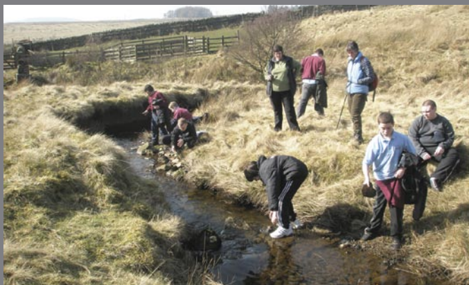
Students from Thomas Bewick School enjoy a walk near Highgreen