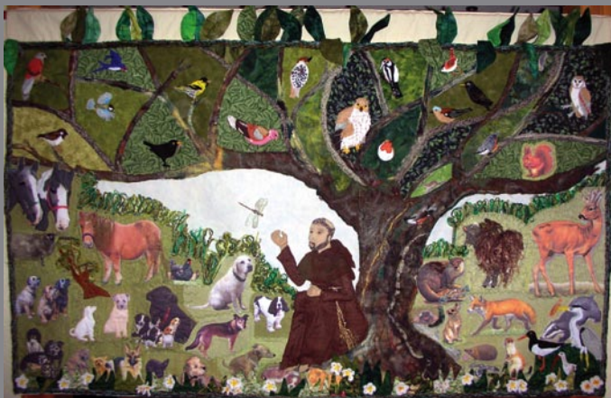
St Francis panel on display in the church at St Francis Tide