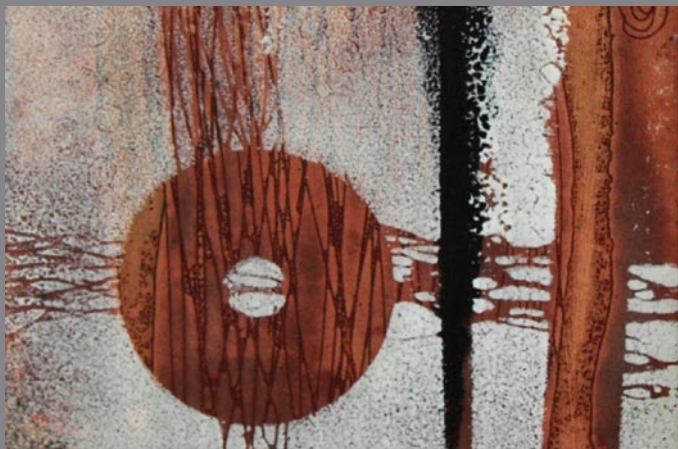
Jilly Morris, Detail of enamel piece, 2009

It is possible to create many different textures, surfaces and looks and wonderful jewel-like colours in fusing liquid or powdered glass onto copper or steel. Beautiful results can be achieved very simply without any special art skills but skills can be readily developed in a very rewarding way.